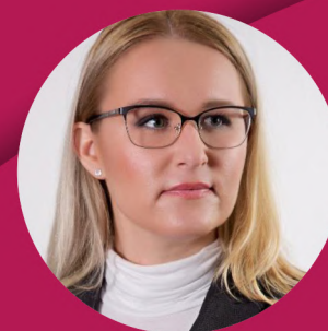
GRB Advanced training

“An excellent training about gender responsive budgeting. It is especially important for new organizations who encountered this issue for the first time. For me personally, this is useful because the tools we learned about at the training are explained well and are applicable, which in turn results in greater visibility of organizations through advocacy for gender responsive budgeting. I would recommend Gender Budget Watchdog Network and their trainings to everyone.”