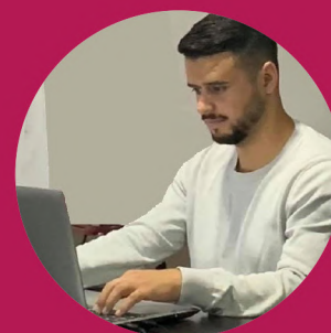
GRB Public finances and procurement training

“This training gave us the opportunity to get introduced to best practices from each country, through the case studies and group work analysis. Being introduced to GRB tools and concepts, analyzing gender policies in the region would help our organizations to develop better watchdogging plans and agendas, to become stronger in the field and to further establish joint collaborations for the future”