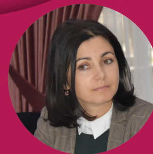
GRB Advanced training

“The Youth Association for Human Rights (YAHR), which operates in the municipalities of Lipjan, Ferizaj and Shtime, has as its main base the monitoring program of local institutions and the advocacy program for human rights. Training on public procurement and gender responsive budgeting from Gender Budget Watchdog Network, is of particular importance to us as has helped us with our work with institutions at the local level. We as an organization, after these trainings have managed to organize an information roundtable in the Municipality of Lipjan with representatives of local institutions, citizens, civil society organizations and the media on the importance of drafting a municipal budget with gender responsibility, as a direct result of the training received by GBWN and Kosovo Women's Network. We recommend these trainings for anyone working with local as well as central budgets from a gender perspective and aiming to institutionalize gender responsive budgeting.”