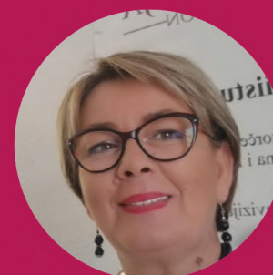
Basic GRB training

“The Association for Human Rights Lex XXI will apply the principles that were explained at the advanced training on GRB. We have to promote these ideas in our community in order to build a democratic society. I am happy that I had such a great opportunity to learn from the best trainers from Serbia.”